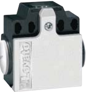
KX CC... - KX CN...